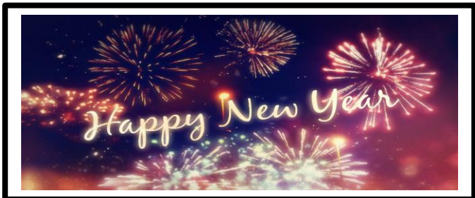
January 2026 Long Range Weather Forecast for The Prairies